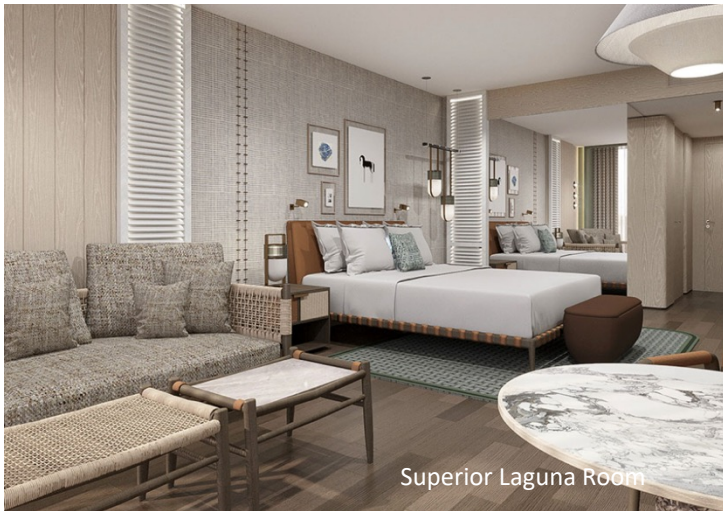
Superior Laguna Room

Upgrades are available. Please speak to David Sledmere for more information and prices